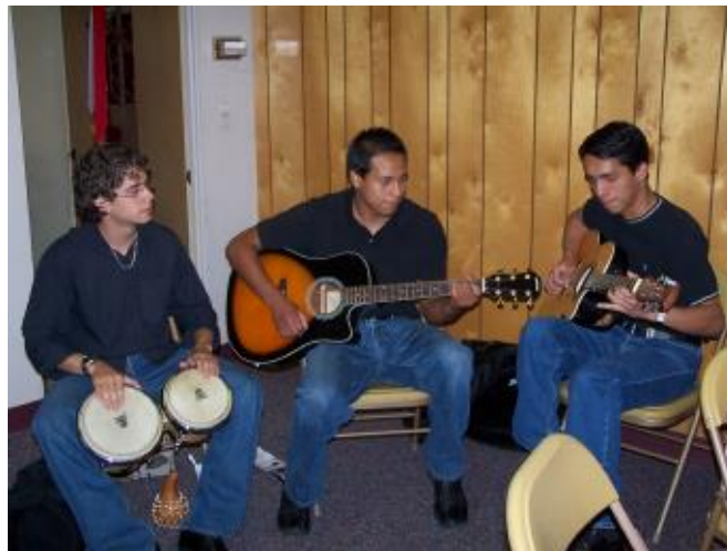
Final Presentation for Humanities 110